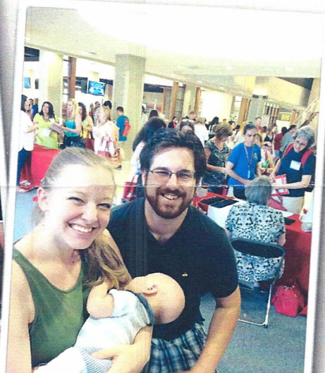
Katie and Will meeting students

We are therefore Christ's Ambassadors as though God were making his appeal through us.