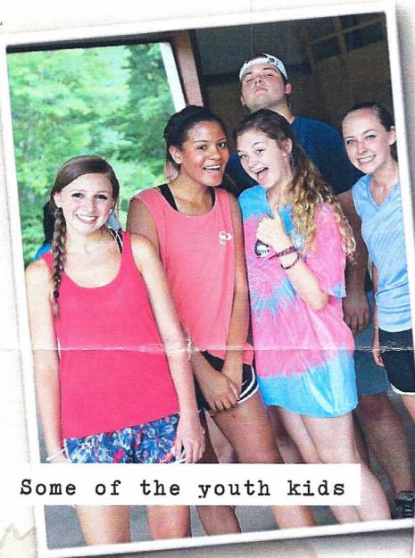
Some of the youth kids